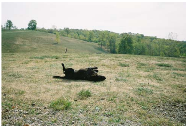
Oh! I ate too much!!