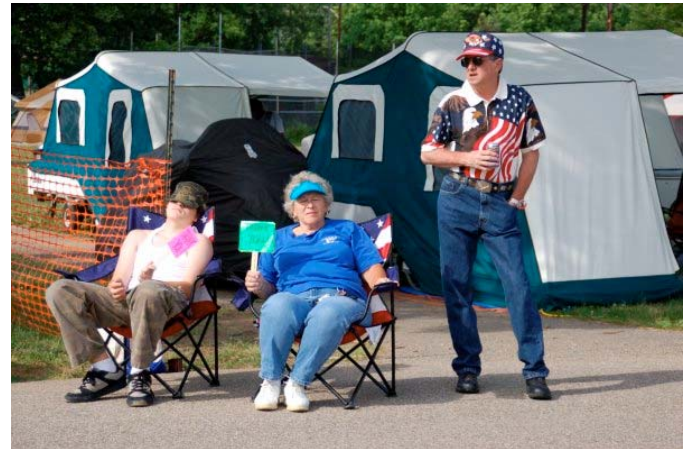
Hard at work on gate duty.